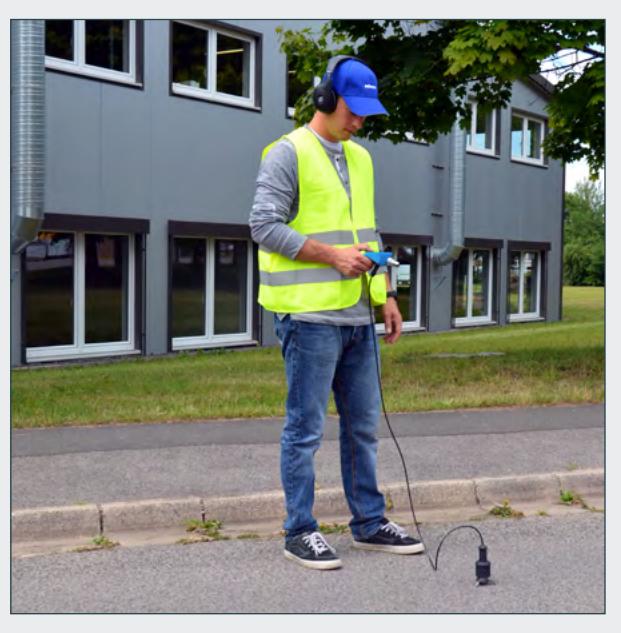
Pinpointing with HL 50-BT and PAM B-2 microphone